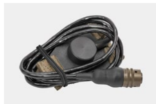
Headset VMC1/VMH3CS/VMXC1-11 Item No. 2909990571