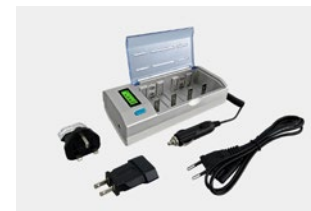
External battery charger 100-240V/50-60Hz, 12V Item No. 2909990847