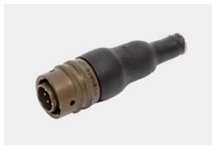
Headset adapter 6 Pole, 3rd generation Item No. 2909990751