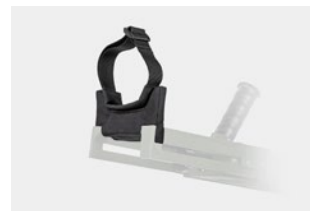
Strap for arm rest VMC1/VMW1 Item No. 8702310101