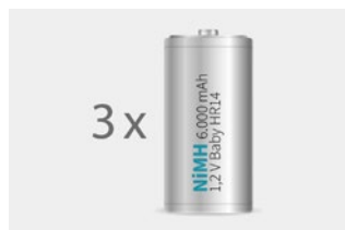
Rechargeable battery NiMH 1,2 V baby HR14/6.000 mAh, 3 ea. Item No. 5920001018S3