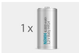
Rechargeable battery NiMH 1,2 V baby HR14/6.000 mAh Item No. 5920001018