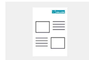
Field manual VMC1 Item No. 2902310115