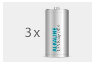
Alkaline battery 1.5 V baby LR14, 3 ea. Item No. 5910001002S3