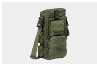
Carrying bag VMC1/VMW1 Item No. 8902310030