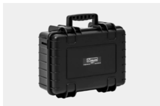
Case VMC1 Item No. 2802310010