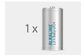
Alkaline battery 1.5 V baby LR14 Item No. 5910001002