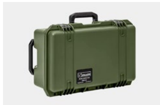
Case VMH3CS Item No. 2802360101