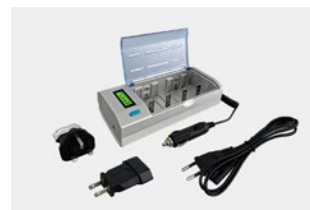
External battery charger 100-240V/50-60Hz, 12V Item No. 2909990847