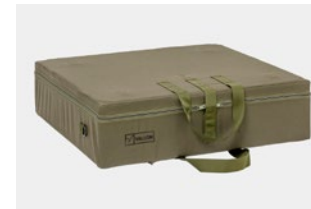
Universal case UXO search coil large Item No. 2802360102