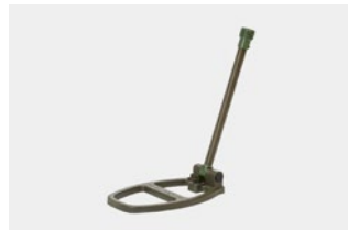
Search coil VMH3CS/VMXC1, oval Item No. 2902360101