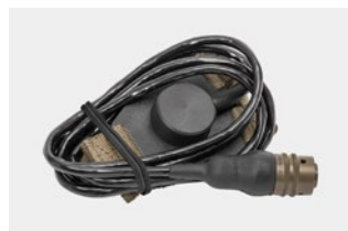
Headset VMC1/VMH3CS/VMXC1-1 Item No. 2909990571