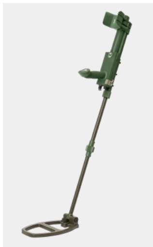
Metal Detector VMH3CS