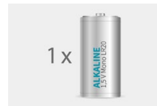
Alkaline battery 1.5 V Mono LR20 Item No. 5910001006