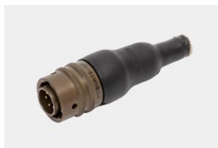
Headset adapter 6 Pole, 3rd generation Item No. 2909990751