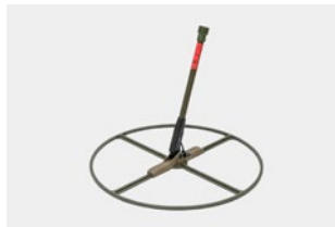
UXO search coil, Ø 60 cm Item No. 2902360111