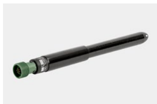
Stick probe VMH3S Item No. 2802360002