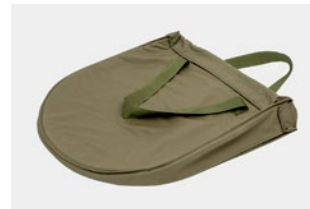
Bag UXO search coil large, olive Item No. 8702360002