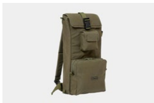
Backpack VMH3CS Item No. 8902360007