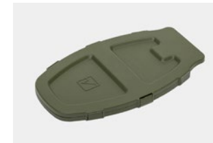
Cover for search coil, oval Item No. 8902293002