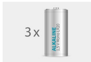
3x Alkaline battery 1.5 V Mono LR20, 3 ea. Item No. 5910001006S3