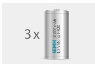
Rechargeable battery NiMH 1,2 V Mono HR20/10.000 mAh, 3 ea. Item No. 5920001006S3