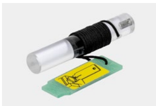
Test piece with adjustment plate for brake screw Item No. 2909990733