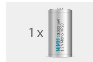
Rechargeable battery NiMH 1,2 V Mono HR20/10.000 mAh Item No. 5920001006