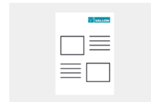
Field manual VMH3CS Item No. 2902360407