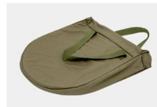
Bag UXO search coil large, olive Item No. 8702360002