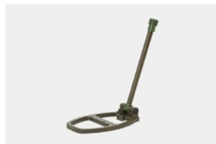
Search coil VMH3CS/VMXC1, oval Item No. 2902360101