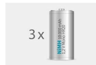
Rechargeable battery NiMH 1,2 V Mono HR20/10.000 mAh, 3 ea. Item No. 5920001006S3