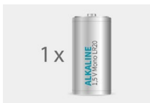
Alkaline battery 1.5 V Mono LR20 Item No. 5910001006