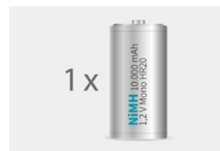
Rechargeable battery NiMH 1,2 V Mono HR20/10.000 mAh Item No. 5920001006