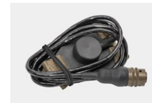
Headset VMC1/VMH3CS/VMXC1-1 Item No. 2909990571