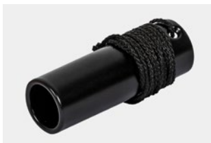
Test piece "ferrous" Item No. 2902530005