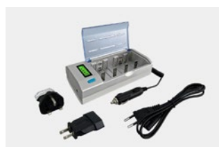
External battery charger 100-240V/50-60Hz, 12V Item No. 2909990847