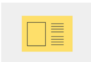
Backpack packing sketch VMXC1-3 Item No. 2902530010