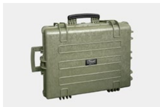
Case VMXC1-1 Item No. 2802530003