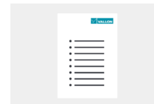
Operation manual VMXC1-3 Item No. 2902530008