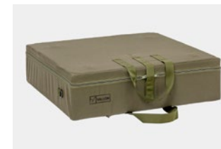
Universal case UXO search coil large Item No. 2802530001