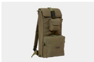
Backpack VMXC1-3 Item No. 8902530002