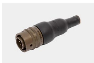
Headset adapter 6 Pole, 3rd generation Item No. 2909990751