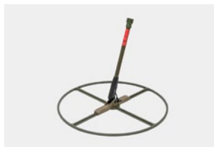
UXO search coil, Ø 60 cm Item No. 2902360111