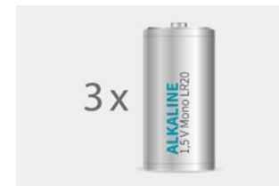
3x Alkaline battery 1.5 V Mono LR20, 3 e Item No. 5910001006S3