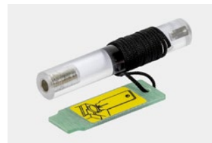
Test piece "non-ferrous" Item No. 2902530018