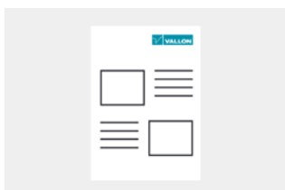
Field manual VMXC1-3 Item No. 2902530009