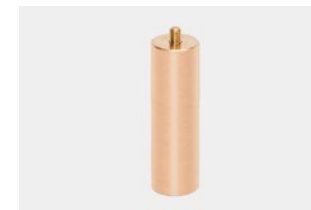
Extra weight Item No. 2909990631