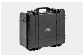
Case electronics set VXB2.1 Item No. 2802590002