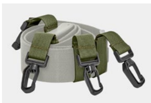
Carabiner for belt Item No. 8902590005