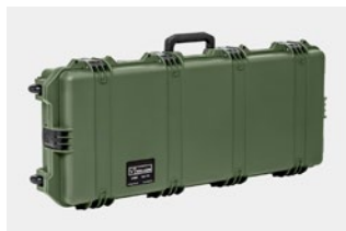
Case sensor set VXB2.1 Item No. 2802590001