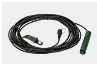
Sensor cable VXB2.1 SEPOS®, 15 m/12 m Item No. 2502590001