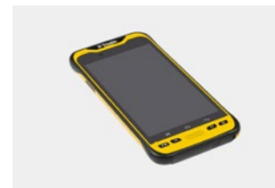
VFC4.1 – Small Field Computer for EVA4mobile® Item No. 2005350001