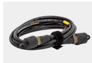
Connection cable SEPOS®-Borehole (VCU) Item No. 2500130032