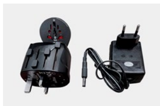
Kit Battery charger Item No. 2902540110