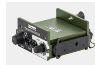
Central electronics unit VCU2 Ambient temperature: -20°C – +50°C Storage temperature: -31°C – +60°C* Item No. 2002540110