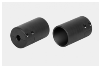
Borehole Shaft Guard Item No. 2900130170