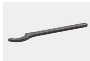
Hook wrench Item No. 9150006024