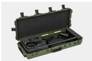
Sensor set VXB2.1 Item No. 2902590001