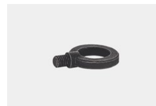
Ring screw Item No. 2909990105