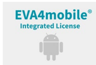
EVA4mobile® – Integrated license in combination with field computer VFC4.1 Item No. 2405350010