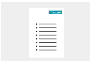
Operation manual VCU2 Item No. 8902540103