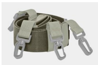
Waist belt Item No. 9150006007