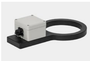
Detector SEPOS®-Borehole Item No. 2900130130