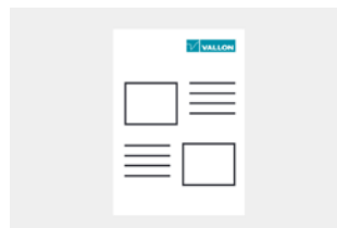
Operation manual VFC4.1 Item No. 8905350000

*Attention: Storage temperature without battery