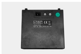
Battery VXB2.1/VXB3plus Item No. 2902540104