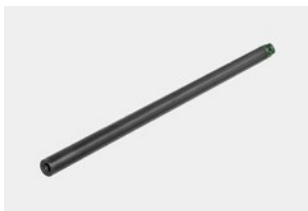
Digital probe VSM4 Item No. 2005320010