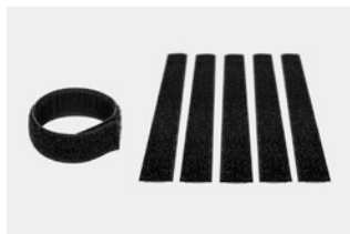
Velcro fastening tape VXT1 6 x 15 cm Item No. 29E4140000