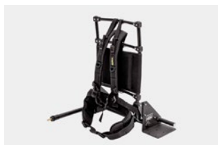
Probe carrier VXT1 Item No. 2904140001