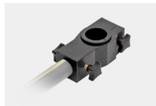
Mounting clip for probe VXT1 Item No. 2902240006