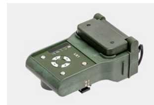
Control unit VX1 Item No. 2903170040