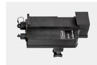
Docking Station VXT1 Item No. 2904140010