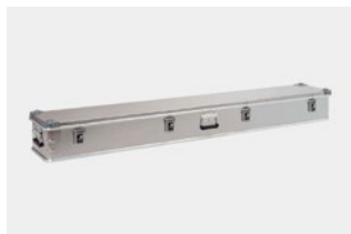
Case VXT1 Item No. 2804140000