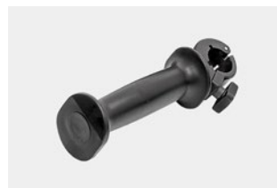
Handle VXT1 Item No. 2902230029