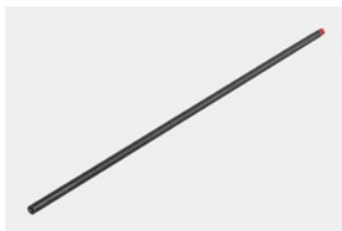
Digital probe VSL Item No. 2909990675