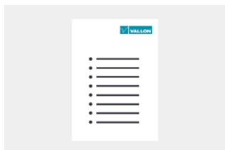
Operation manual VXT1 Item No. 2904140000