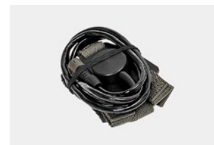
Headset VX1/VXT1 Item No. 2903170320