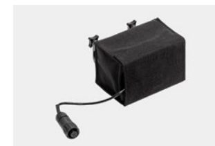
Set power supply Item No. 2902200218