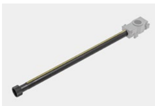
Carrying bar front VXT1 Item No. 2102230006