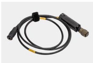
Connection cable probe VXT1 Item No. 2504140000