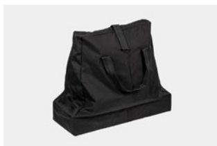
Transport bag for probe carrier VXT1 Item No. 2802240001